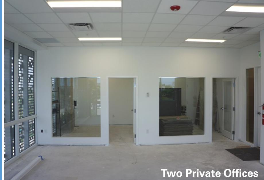
Two Private Offices