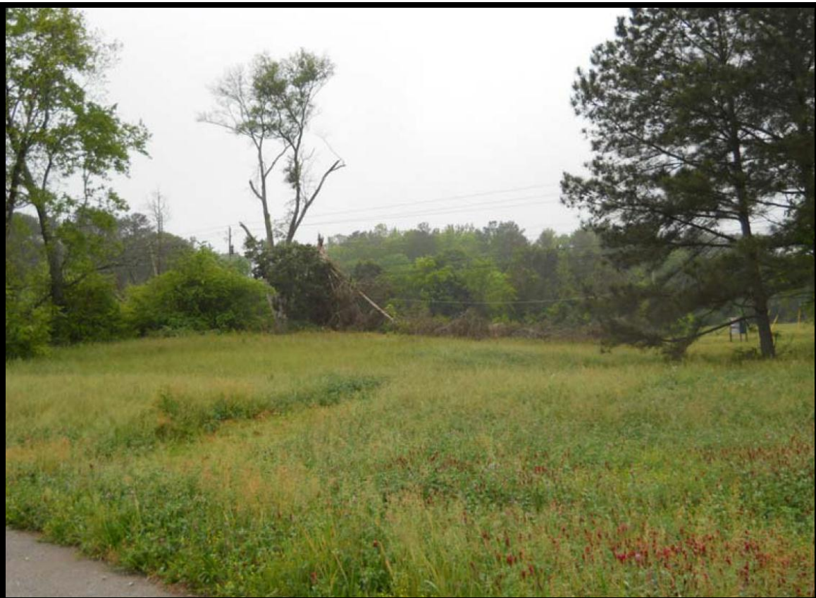
VIEW OF SUBJECT