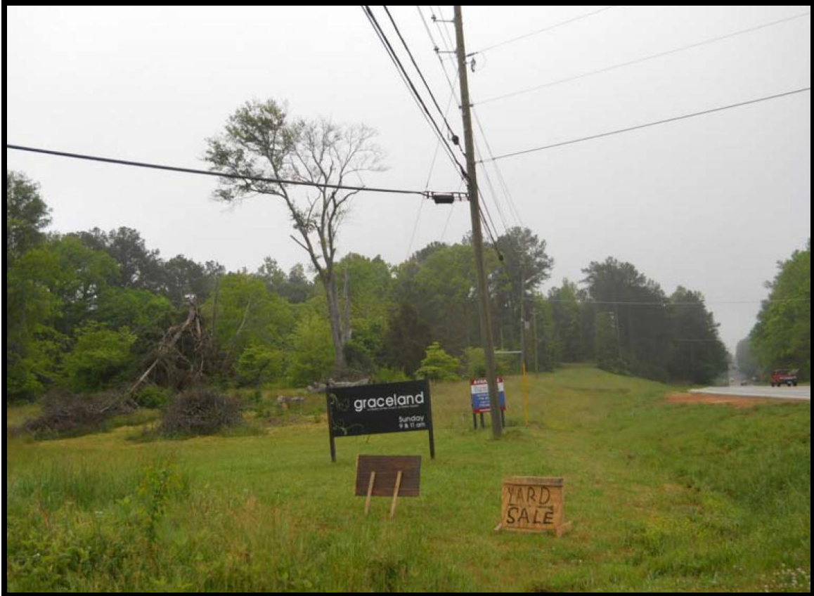
VIEW OF SUBJECT