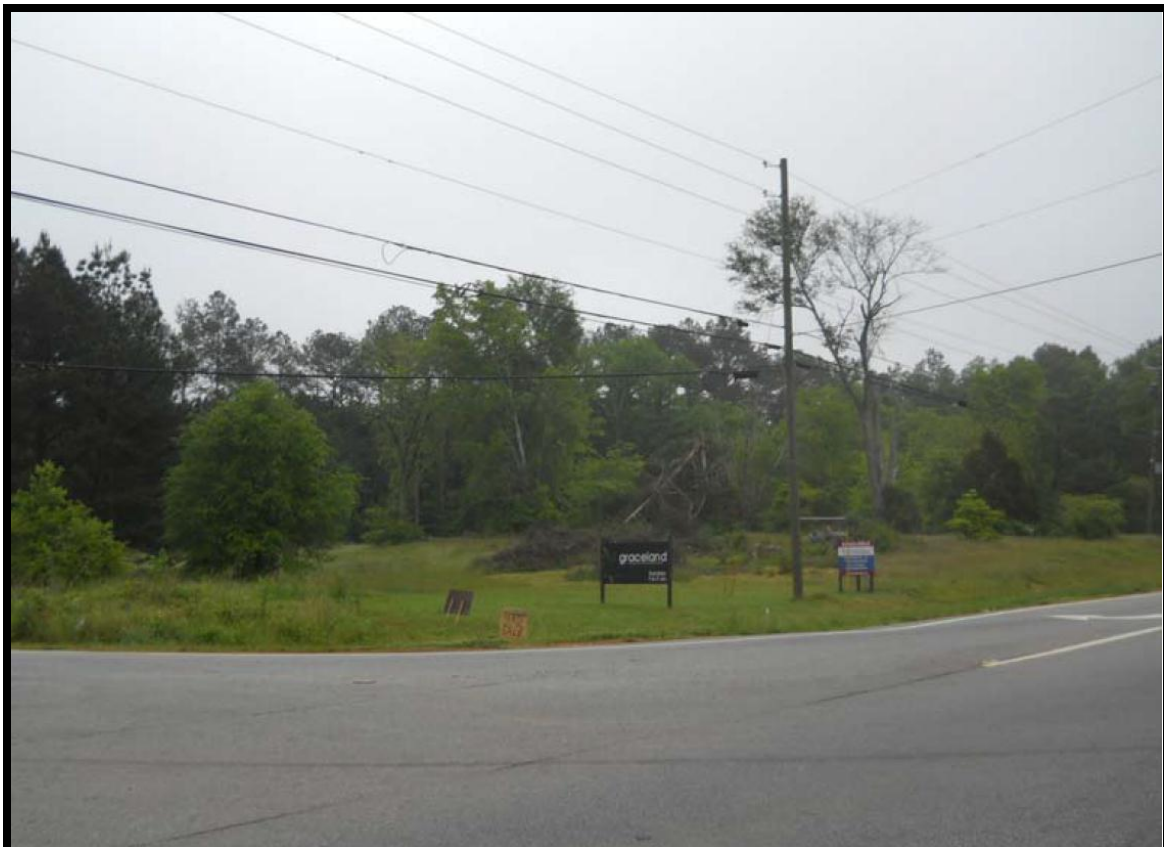
VIEW OF SUBJECT