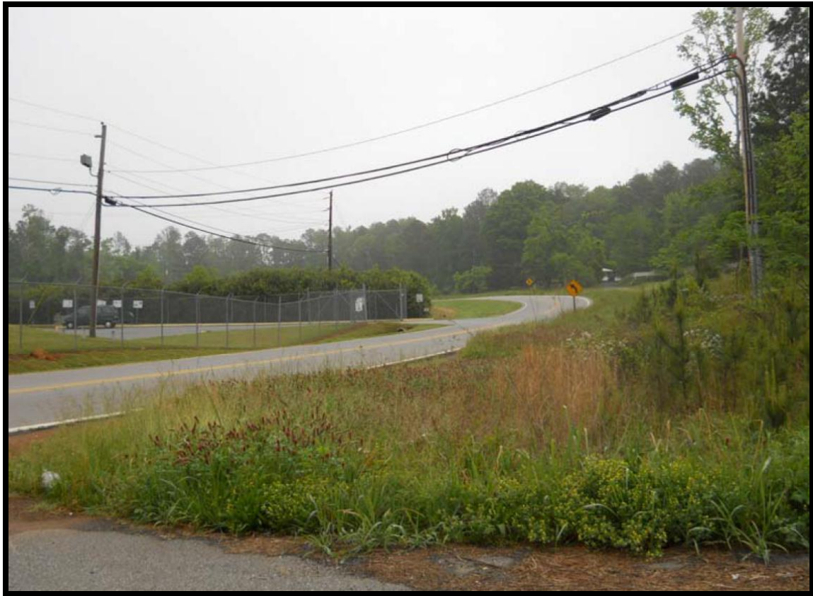
LOOKING NORTH ON JOE FRANK HARRIS PARKWAY