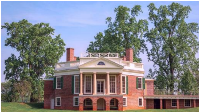
THOMAS JEFFERSON'S POPLAR FOREST

Another popular attraction in Lynchburg is the Maier Museum of Art located at Randolph College. This museum is one of the best American Art collections in the country through the 19th-21st centuries. One of the most popular trails in the city, The Blackwater Creek Trail, is perfect for jogging, walking, biking, and more.