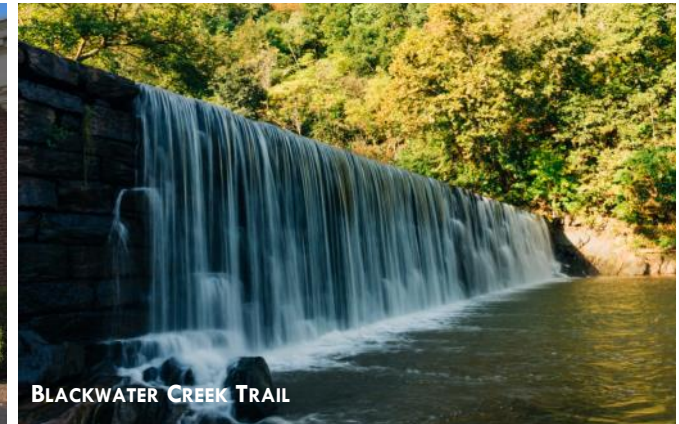
BLACKWATER CREEK TRAIL

THIS INFORMATION HAS BEEN SECURED FROM SOURCES WE BELIEVE TO BE RELIABLE, BUT WE MAKE NO REPRESENTATIONS OR WARRANTIES, EXPRESSED OR IMPLIED, AS TO THE ACCURACY OF THE INFORMATION. REFERENCES TO SQUARE FOOTAGE OR AGE ARE APPROXIMATE. UPLAND HAS NOT REVIEWED OR VERIFIED THIS INFORMATION. BUYER MUST VERIFY THE INFORMATION AND BEARS ALL RISK FOR ANY INACCURACIES.