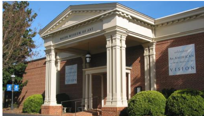
MAIER MUSEUM OF ART