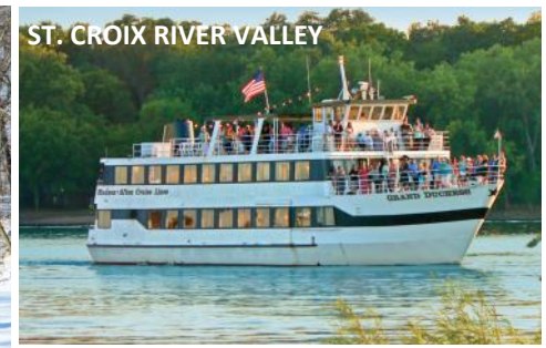
ST. CROIX RIVER VALLEY

THIS INFORMATION HAS BEEN SECURED FROM SOURCES WE BELIEVE TO BE RELIABLE, BUT WE MAKE NO REPRESENTATIONS OR WARRANTIES, EXPRESSED OR IMPLIED, AS TO THE ACCURACY OF THE INFORMATION. REFERENCES TO SQUARE FOOTAGE OR AGE ARE APPROXIMATE. UPLAND HAS NOT REVIEWED OR VERIFIED THIS INFORMATION. BUYER MUST VERIFY THE INFORMATION AND BEARS ALL RISK FOR ANY INACCURACIES.