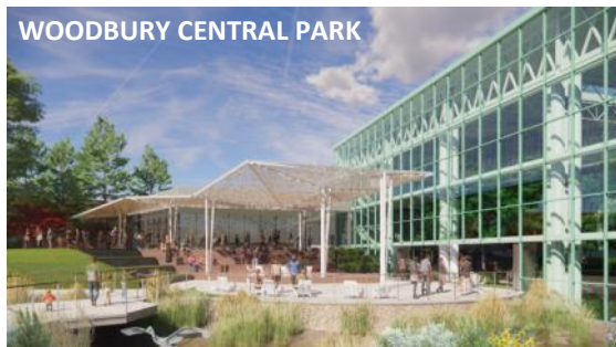
WOODBURY CENTRAL PARK