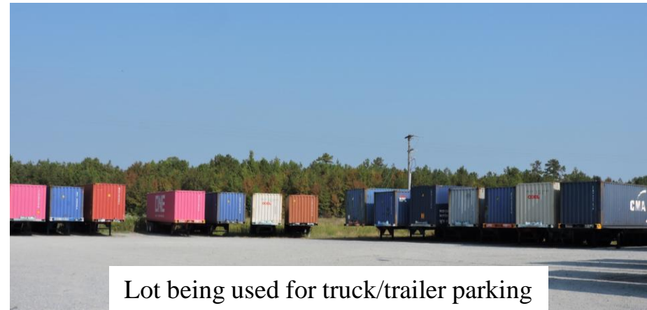
Lot being used for truck/trailer parking

Nearby businesses include International Paper, Zschimmer and Schwarz, Inc., Sellers Construction, Active Minerals, Industrial Steel and Machinery, ISP Alliance, and industrial businesses.