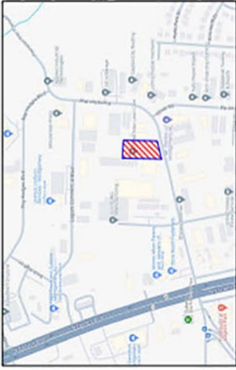
Visibility Map XTB

Current Zoning Per City of Montgomery, Alabama M-1 (Light Industry District) Site Area - 1.00 Acres Site Area - 43,560 Sq. Ft. Minimum Building Height - 20 Feet Minimum Building Footprint - 2000 Sq. Ft. Minimum Building Area - 2000 Sq. Ft. Minimum Building Volume - 20000 Cu. Ft. Minimum Building Spacing - 10 Feet Minimum Building Setback - 10 Feet Minimum Building Footprint - 2000 Sq. Ft. Minimum Building Area - 2000 Sq. Ft. Minimum Building Volume - 20000 Cu. Ft. Minimum Building Spacing - 10 Feet Minimum Building Setback - 10 Feet