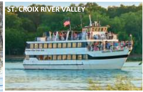
ST. CROIX RIVER VALLEY

THIS INFORMATION HAS BEEN SECURED FROM SOURCES WE BELIEVE TO BE RELIABLE, BUT WE MAKE NO REPRESENTATIONS OR WARRANTIES, EXPRESSED OR IMPLIED, AS TO THE ACCURACY OF THE INFORMATION. REFERENCES TO SQUARE FOOTAGE OR AGE ARE APPROXIMATE. UPLAND HAS NOT REVIEWED OR VERIFIED THIS INFORMATION. BUYER MUST VERIFY THE INFORMATION AND BEARS ALL RISK FOR ANY INACCURACIES.