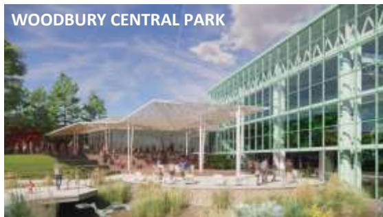
WOODBURY CENTRAL PARK