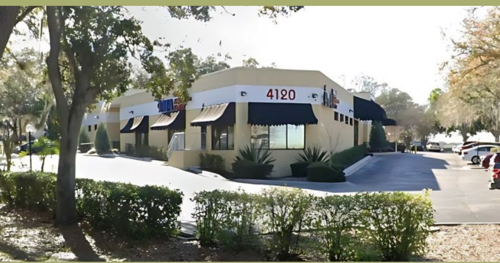
4120 US Hwy 98 N., Lakeland, Florida 33809

4120 US Hwy 98 N. Lakeland, Florida 33809