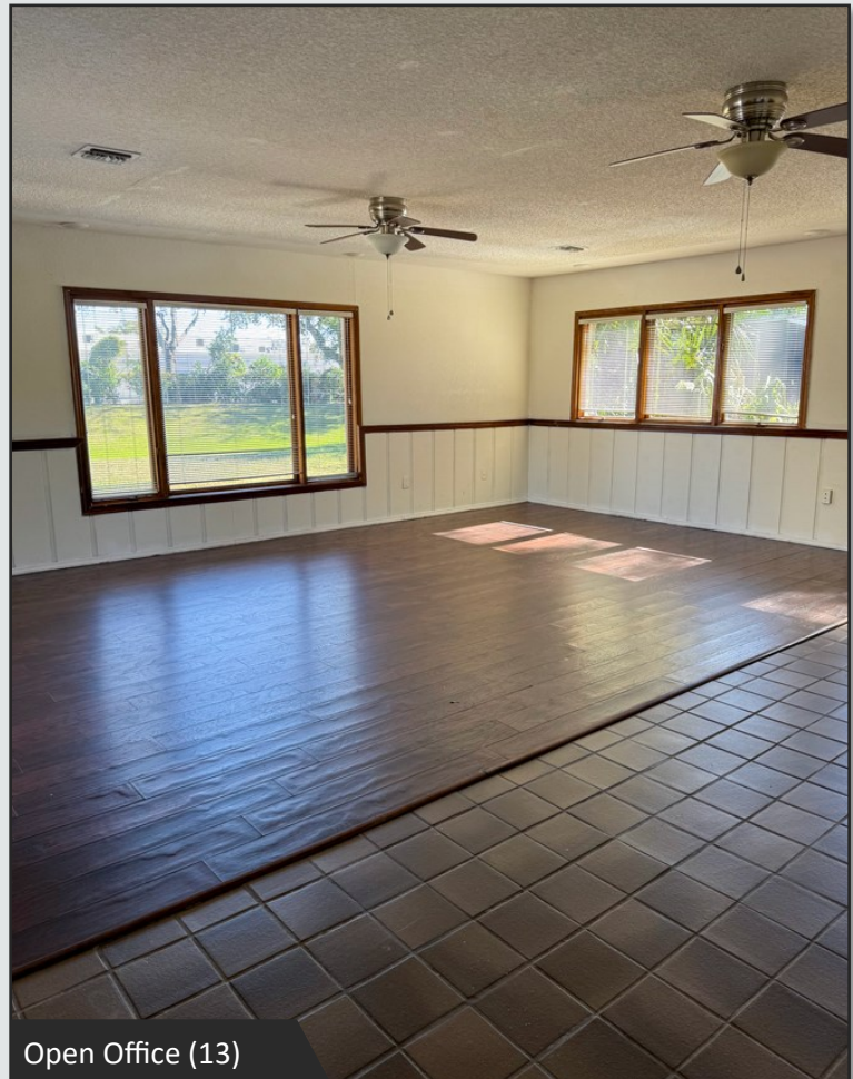
Open Office (13)