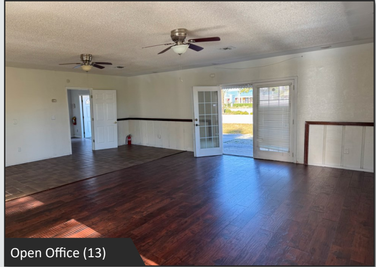
Open Office (13)