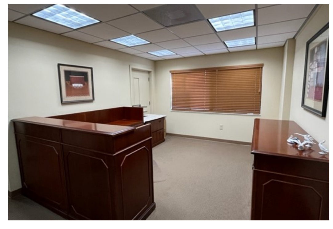
HIGHEST AND BEST USE: PROFESSIONAL OFFICE SPACE FOR OWNER/ USER OR TENANT OCCUPANCY