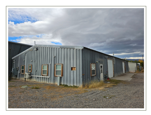
Pricing and availability may change at any time, at Owner's sole discretion without notice. Interested parties to verify information. Owner reserves the right to approve or disapprove any application for any reason.