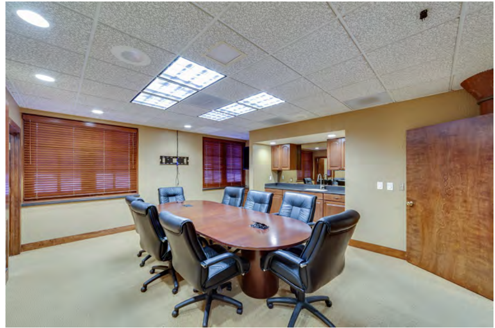
2 nd Floor | Conference Room