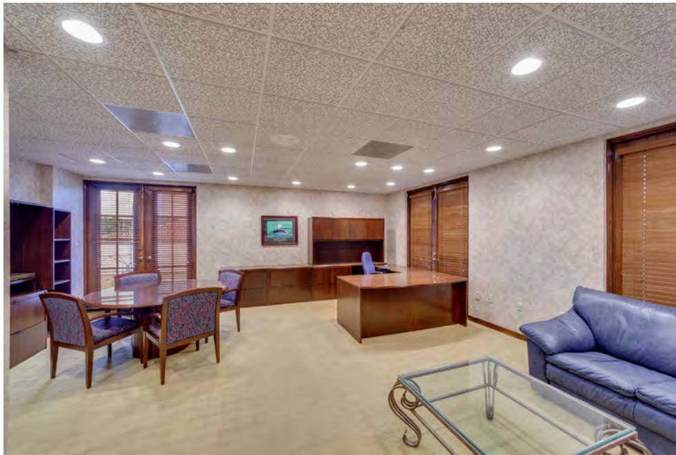
3 rd Floor | Office