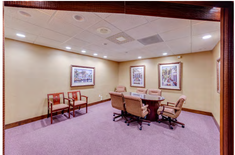
2 nd Floor | Conference Area