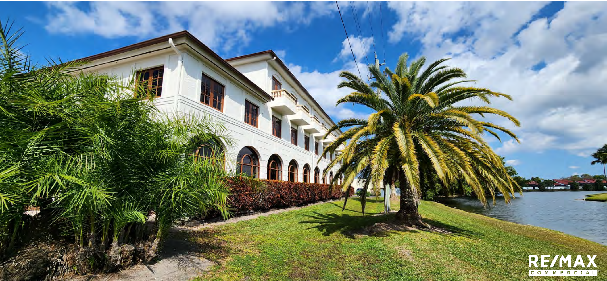
Back of Building with Lake View