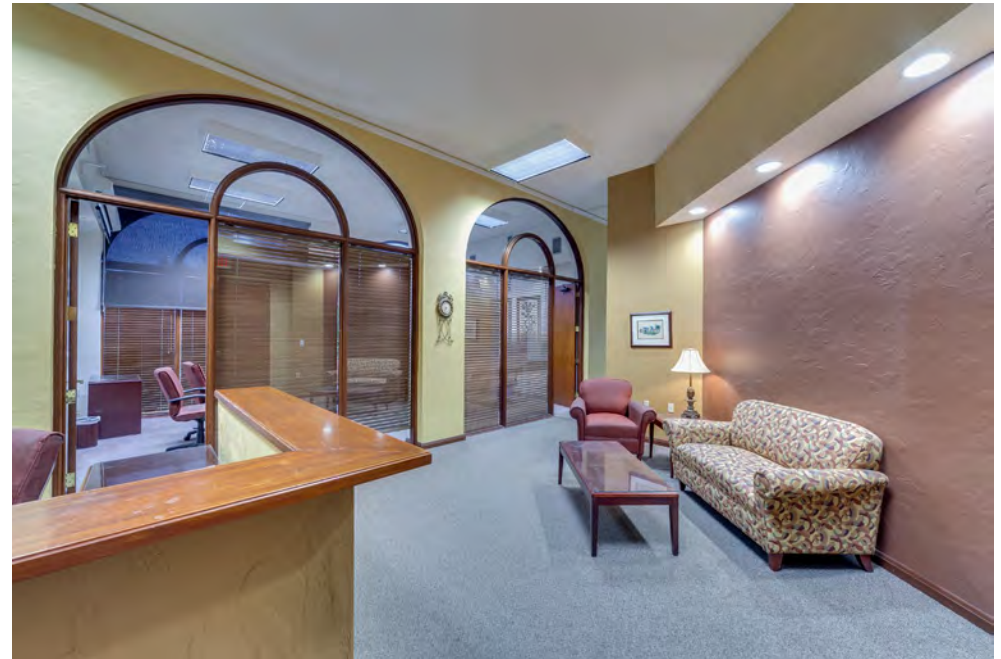
1 st Floor | Suite 110