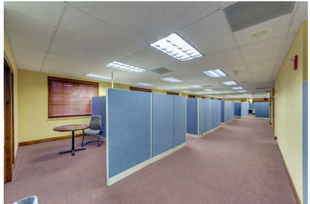
2 nd Floor | Office Area