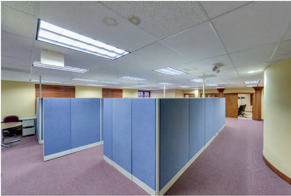
2 nd Floor | Office Area