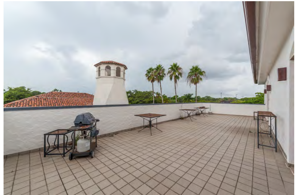
3 rd Floor | Balcony