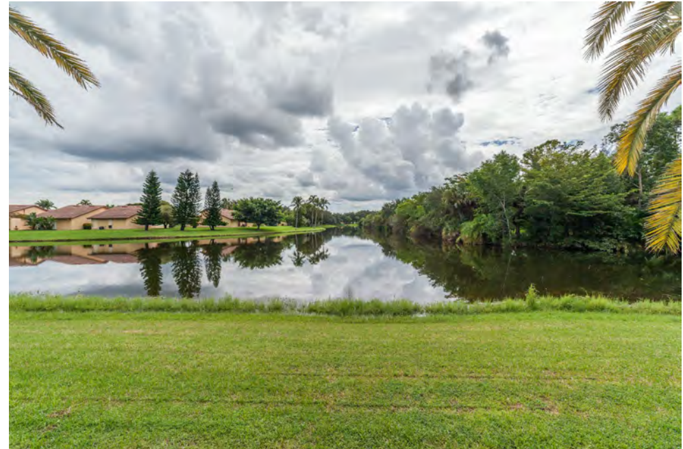
Lake behind property