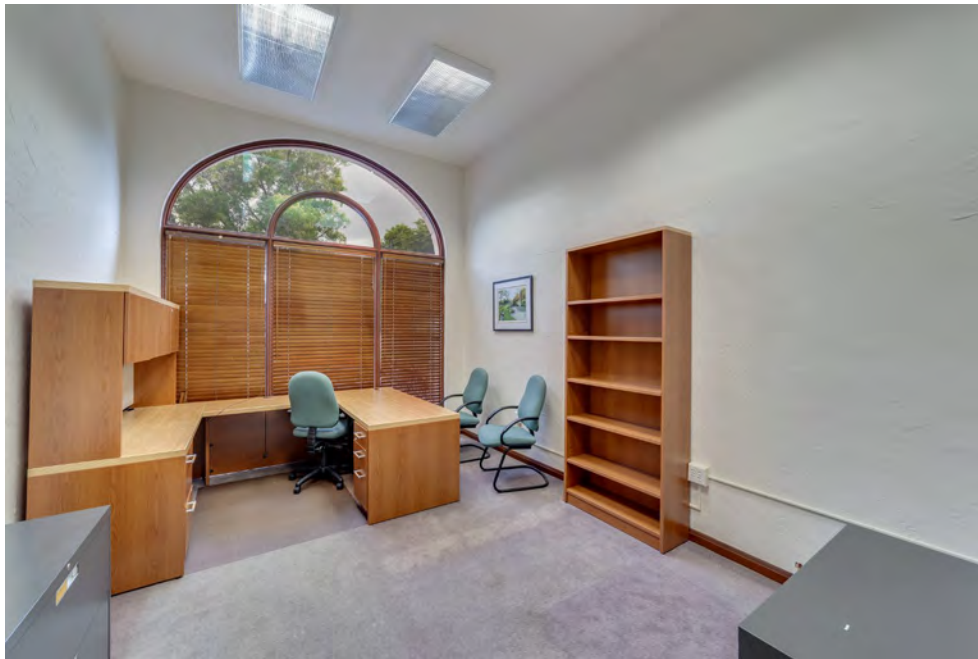
1 st Floor | Suite 100 | Office