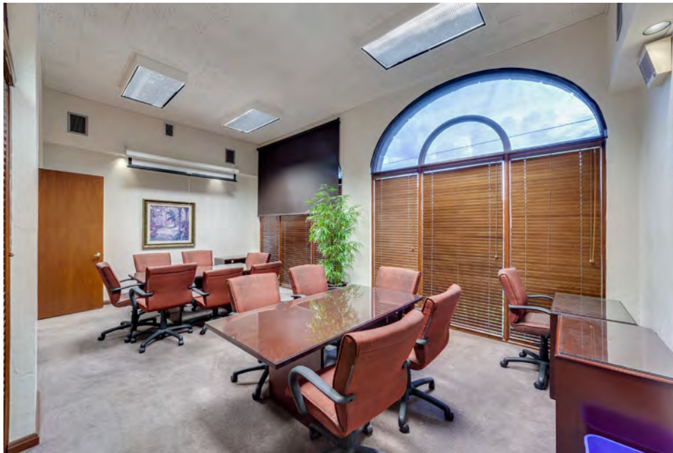
1 st Floor | Suite 100 | Conference Room