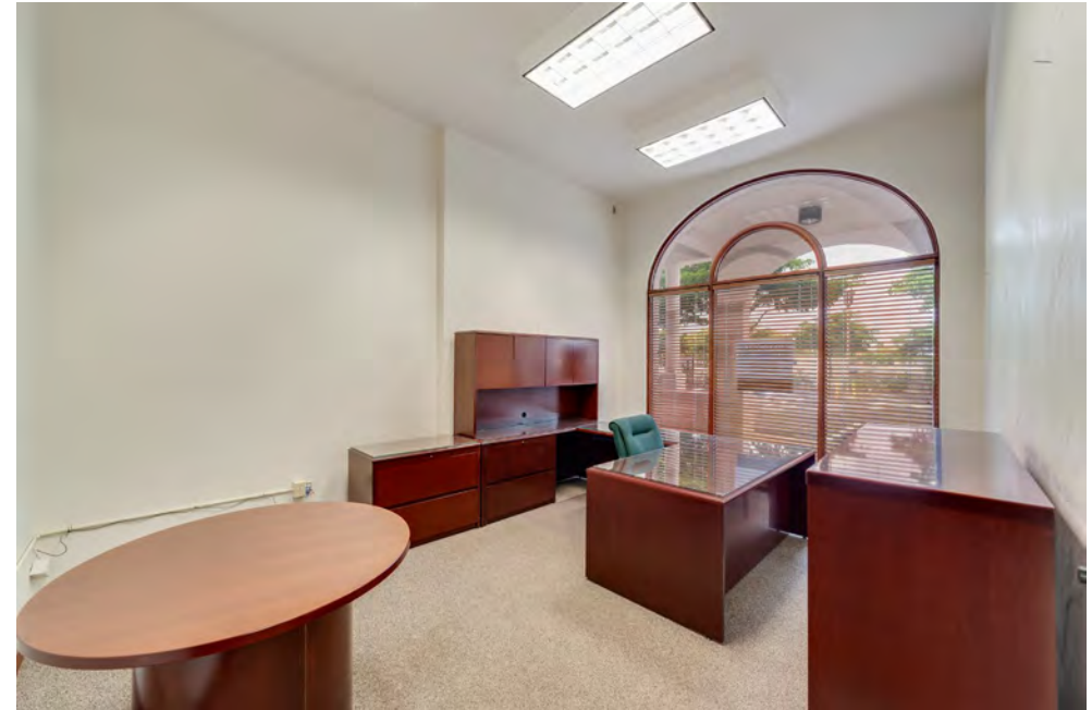
1 st Floor Offices