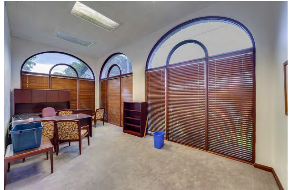
1 st Floor | Suite 100 | Office