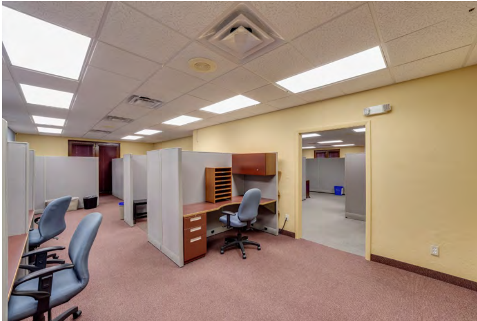
3 rd Floor | Office Area