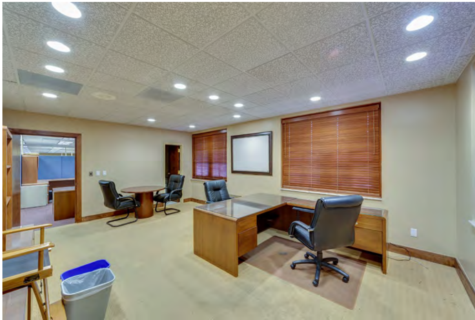
2 nd Floor | Office