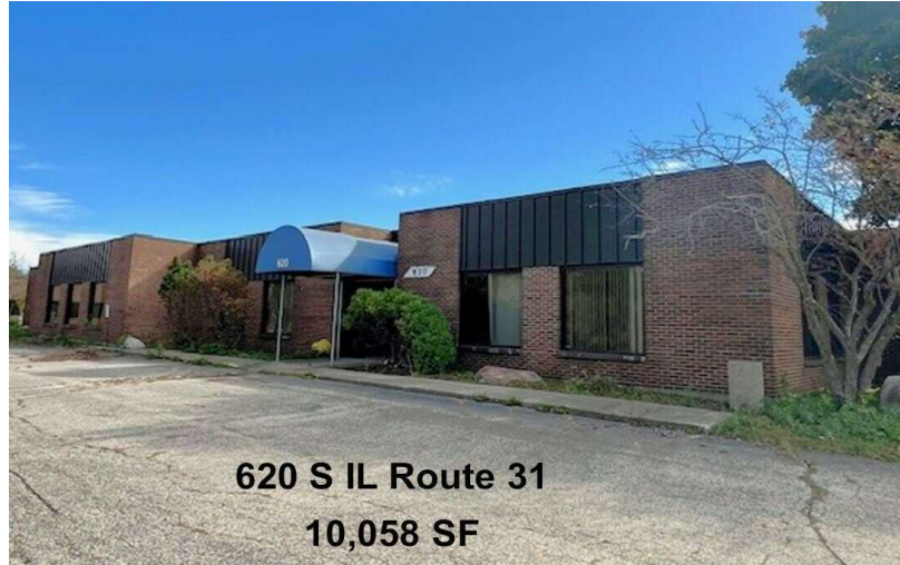
620 S IL Route 31 10,058 SF