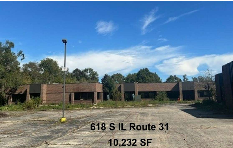
618 S IL Route 31 10,232 SF