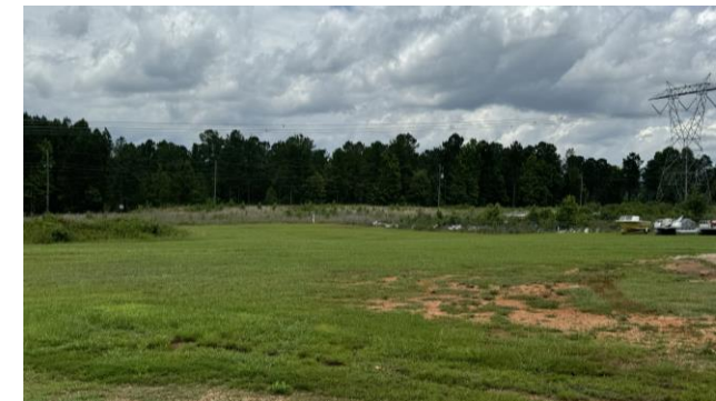
Additional Acreage for Expansion ( approx. 2 acres)