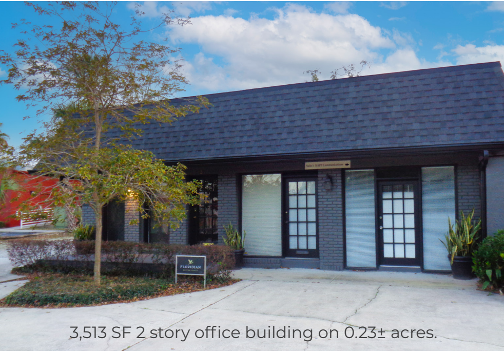
3,513 SF 2 story office building on 0.23± acres.