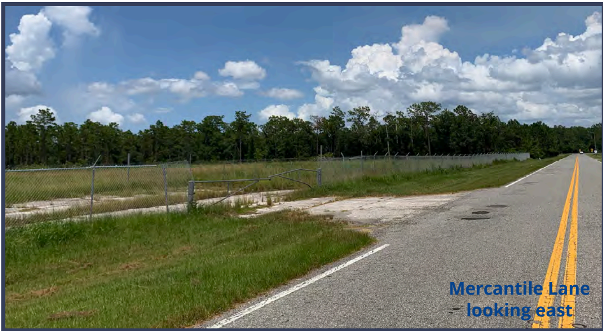
Mercantile Lane looking east