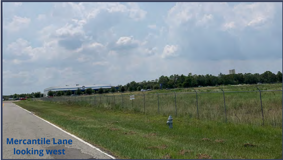
Mercantile Lane looking west