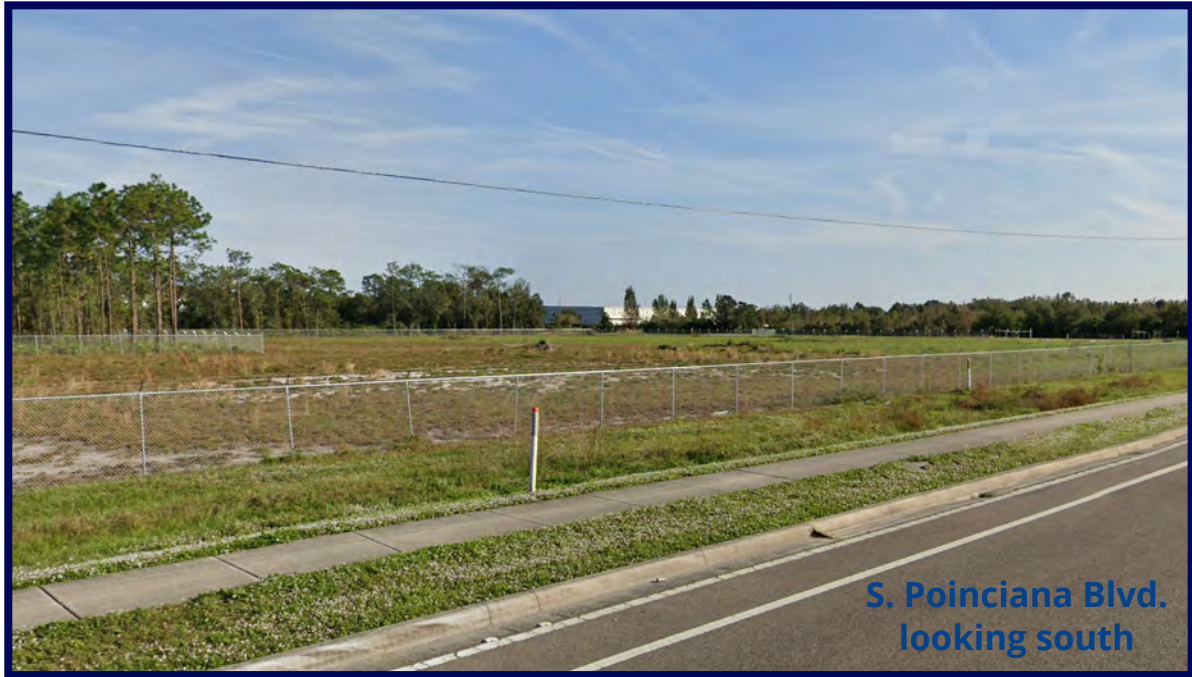
S. Poinciana Blvd. looking south