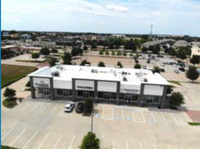
BUILDING A | 9188 PRESTMONT PL