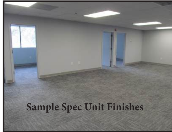
Sample Spec Unit Finishes