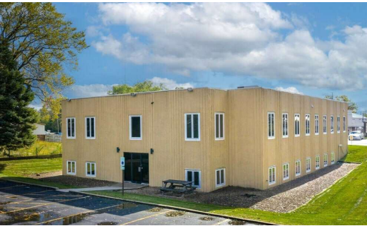
LOWER LEVEL 4,490 SF Rear Entrance