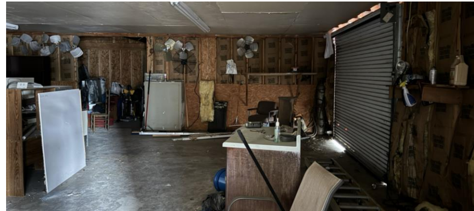
Suite C – Shop Space