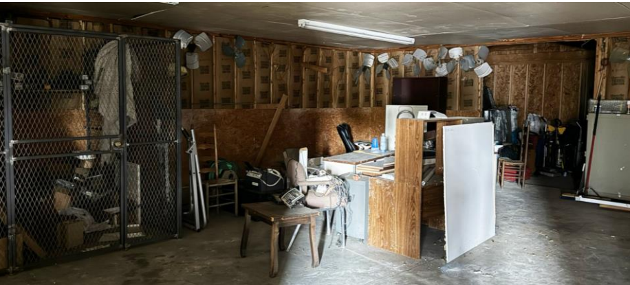
Suite C – Shop Space