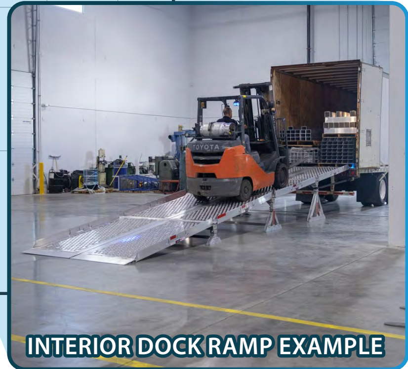
INTERIOR DOCK RAMP EXAMPLE