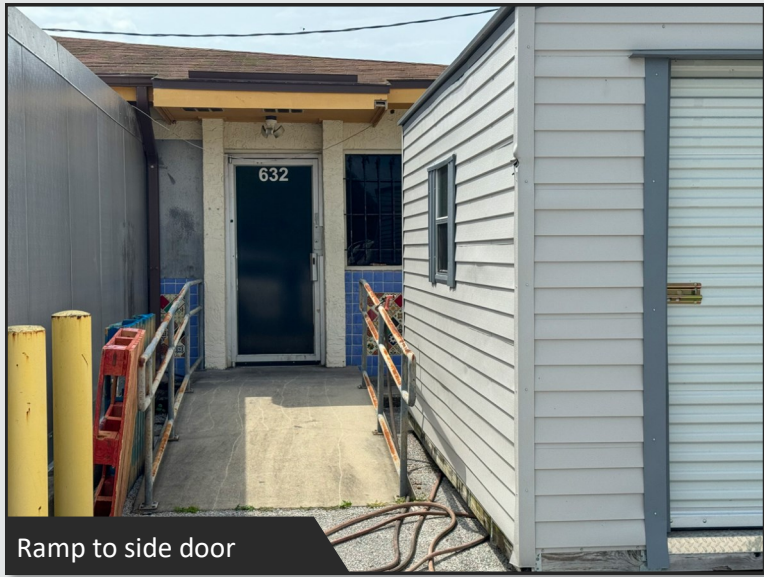
Ramp to side door