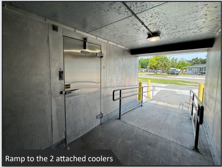
Ramp to the 2 attached coolers