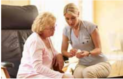
STAT Home Health