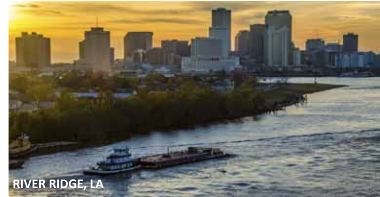
RIVER RIDGE, LA

The French Quarter, the oldest neighborhood in New Orleans, filled with colorful French Colonial townhouses with wrought-iron balconies. Bourbon Street is infamous for its energetic party scene, with people visiting from all over the world to experience the unique energy, especially during Mardi Gras.