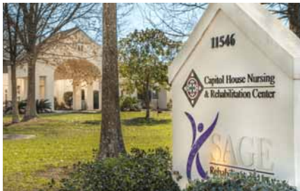
Capitol House Nursing & Rehabilitation