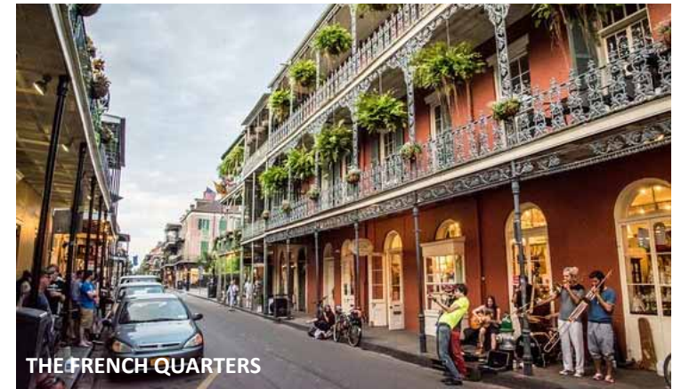
THE FRENCH QUARTERS