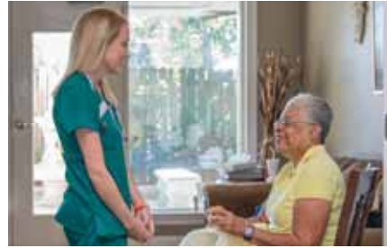
The Carpenter House