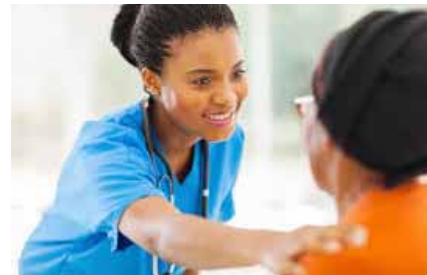
AIM Palliative Home Health