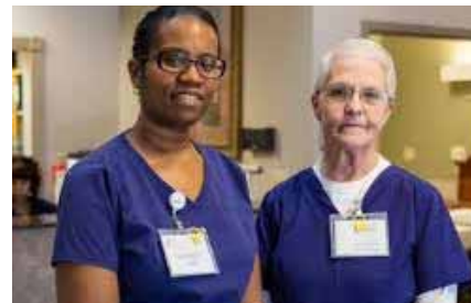
Sage Specialty Hospital (LTAC)

Mission: The Carpenter Health Network will joyfully provide optimal patient care seamlessly across service lines to ensure spiritual, emotional, and physical healing wherever possible while always respecting life, fostering dignity, and preserving quality of life.