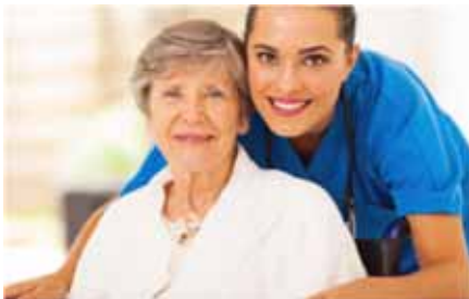
St. Joseph Hospice