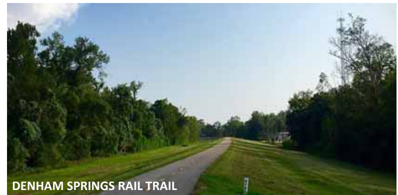
DENHAM SPRINGS RAIL TRAIL