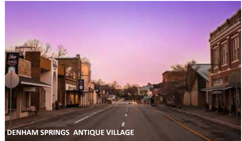
DENHAM SPRINGS ANTIQUE VILLAGE

For those who want to embrace the outdoors, North Park, Spring Park, the Denham Springs Rail Trail, and the Greystone Country Club all offer a variety of activities. The Greystone Country Club is a semi-private golf facility catering to both members and the public. Greystone boasts a challenging 18-hole course stretching over 7,000 yards. Beyond golf, the facilities also include a resort-style swimming pool, children’s spray park, basketball court, tennis courts, and a playground, making it a destination for all ages.