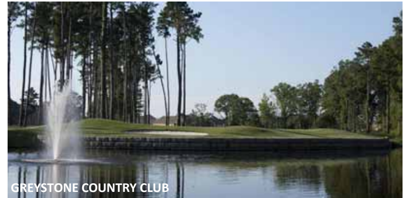
GREYSTONE COUNTRY CLUB