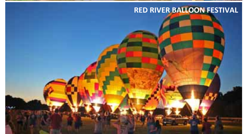
RED RIVER BALLOON FESTIVAL