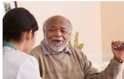
Companion House Services