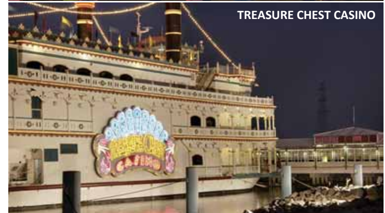
TREASURE CHEST CASINO