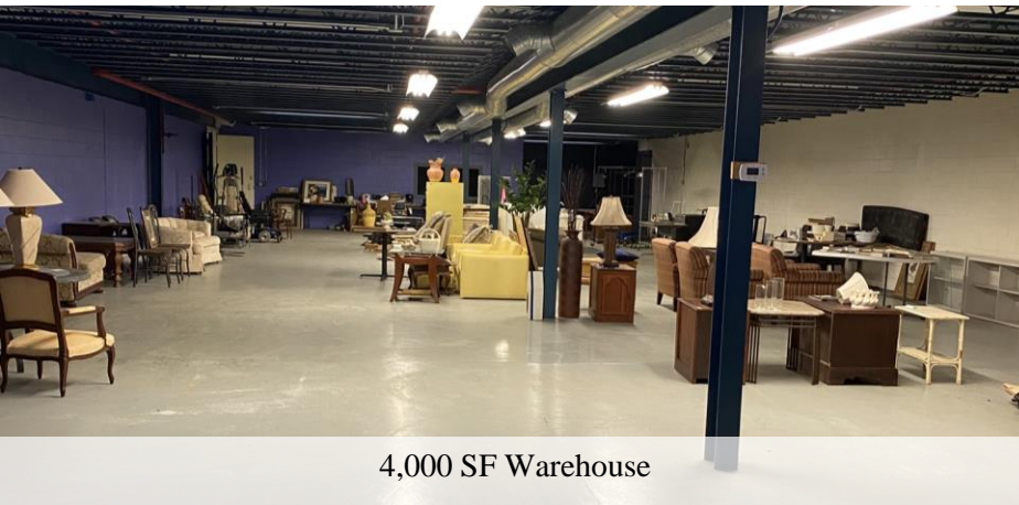
4,000 SF Warehouse