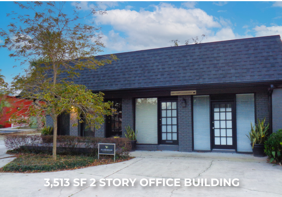
3,513 SF 2 STORY OFFICE BUILDING