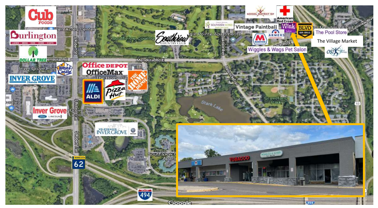
This information is accurate as of the date of printing and is subject to change without notice. All information is deemed accurate, but cannot be guaranteed.