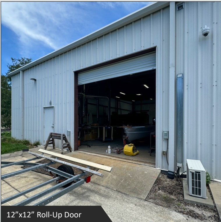
12"x12" Roll-Up Door