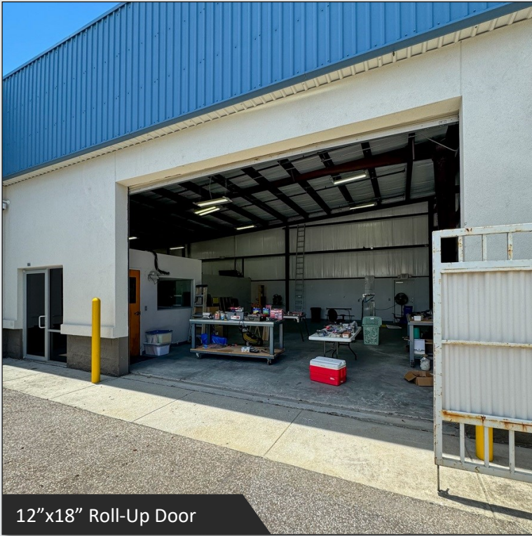
12"x18" Roll-Up Door