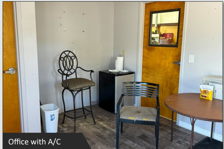
Office with A/C