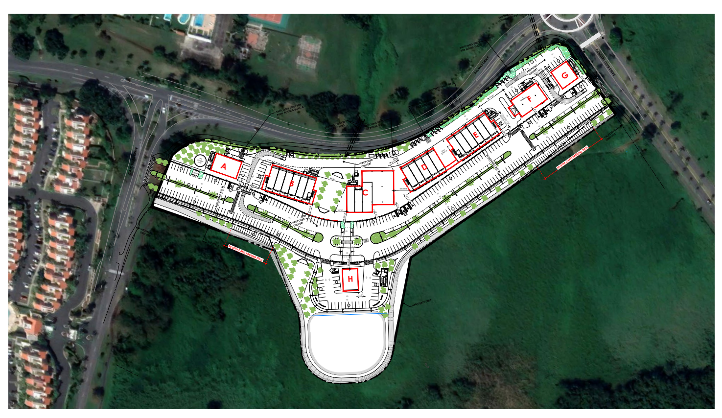
The information contained herein, including, without limitation, any and all artist's or architectural conceptual renderings, plans, floor plans, specifications, features, facilities, dimensions, measurements, and amenities depicted, or otherwise described herein, are based upon current development plans, which are subject to change or abandonment without notice, and may not be relied upon.

Palmas del Mar is an award-winning destination and resort community located in Puerto Rico's southeastern coast. This area sits 45 minutes from San Juan, 15 minutes from the private airport at the former Roosevelt Roads Navy Base, and it is just a short boat ride from the islands of Vieques and Culebra that provide world class fishing and diving. The development stretches out approximately 3,000 acres, and it is marked by beautiful beaches, lavish homes, extensive gardens, two championship golf courses, the most complete and largest tennis center in the Caribbean, Pickleball courts, a Hotel, and The Yacht Club Marina. Palmas also offers excellent academic facilities (PK-12), an equestrian center, plus access to the beach and country clubs.