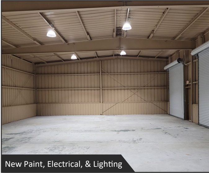
New Paint, Electrical, & Lighting