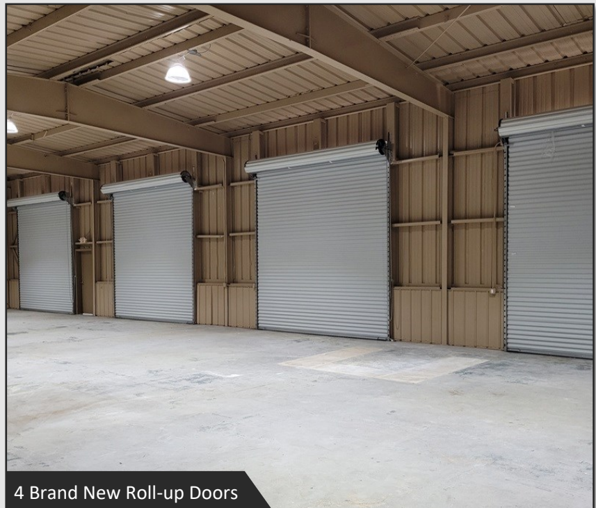
4 Brand New Roll-up Doors