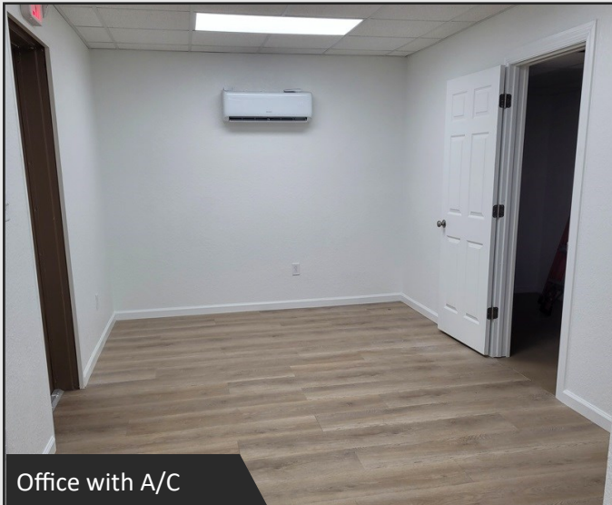
Office with A/C