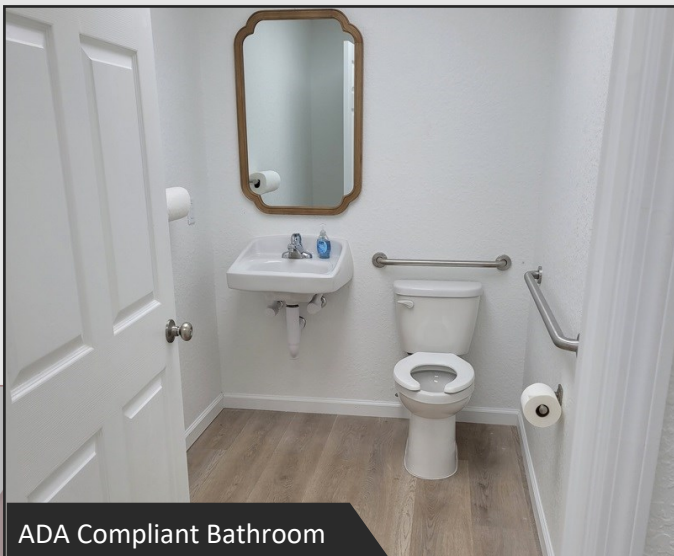
ADA Compliant Bathroom