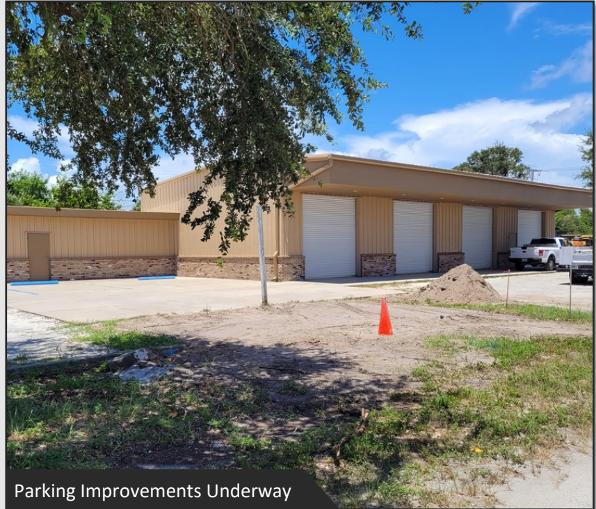
Parking Improvements Underway