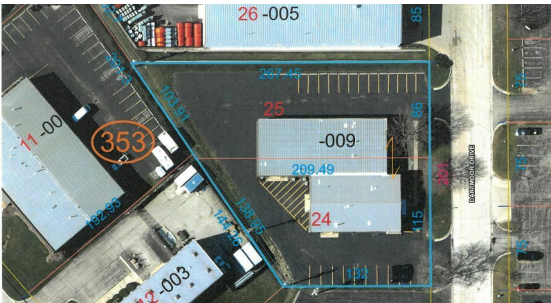
ALTA/NSPS LAND TITLE SURVEY