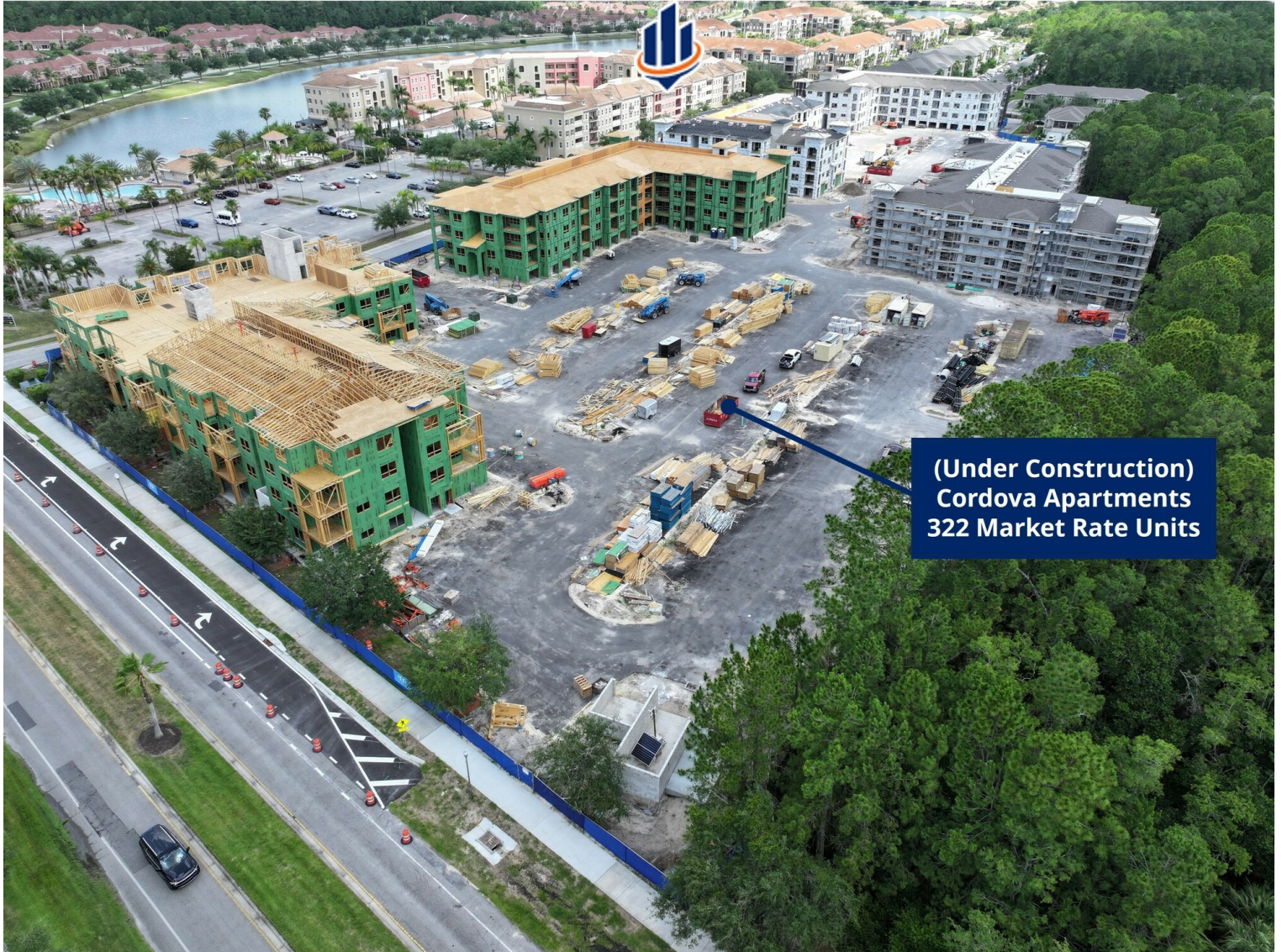
(Under Construction) Cordova Apartments 322 Market Rate Units