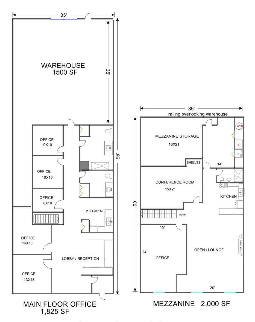
all measurements are approximate