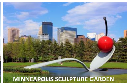
MINNEAPOLIS SCULPTURE GARDEN

THIS INFORMATION HAS BEEN SECURED FROM SOURCES WE BELIEVE TO BE RELIABLE, BUT WE MAKE NO REPRESENTATIONS OR WARRANTIES, EXPRESSED OR IMPLIED, AS TO THE ACCURACY OF THE INFORMATION. REFERENCES TO SQUARE FOOTAGE OR AGE ARE APPROXIMATE. UPLAND HAS NOT REVIEWED OR VERIFIED THIS INFORMATION. BUYER MUST VERIFY THE INFORMATION AND BEARS ALL RISK FOR ANY INACCURACIES.