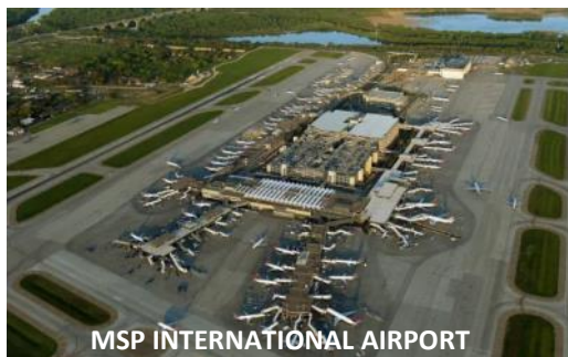
MSP INTERNATIONAL AIRPORT