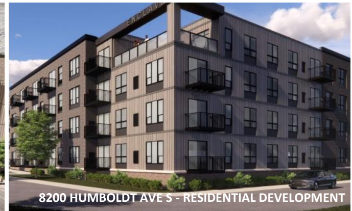
8200 HUMBOLDT AVE S - RESIDENTIAL DEVELOPMENT

THIS INFORMATION HAS BEEN SECURED FROM SOURCES WE BELIEVE TO BE RELIABLE, BUT WE MAKE NO REPRESENTATIONS OR WARRANTIES, EXPRESSED OR IMPLIED, AS TO THE ACCURACY OF THE INFORMATION. REFERENCES TO SQUARE FOOTAGE OR AGE ARE APPROXIMATE. UPLAND HAS NOT REVIEWED OR VERIFIED THIS INFORMATION. BUYER MUST VERIFY THE INFORMATION AND BEARS ALL RISK FOR ANY INACCURACIES.