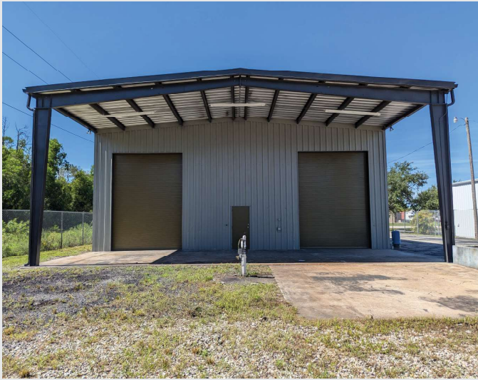
19'x50' Covered Pad 2-16' Doors