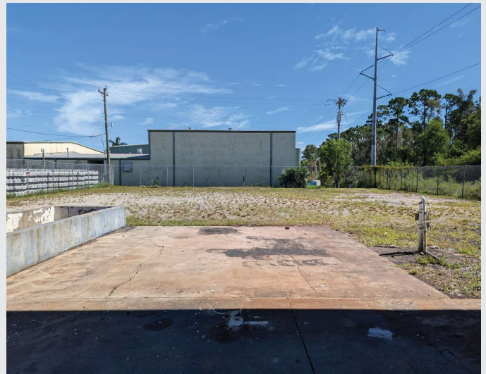
Ample Rear Parking