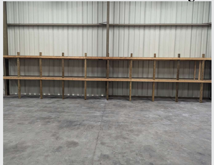
Heavy Duty Shelving