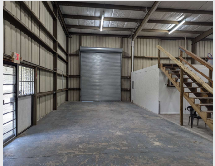
14' Door & Over Office Storage