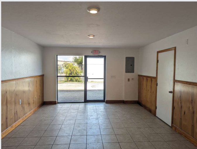
19'x12' Air Conditioned Office