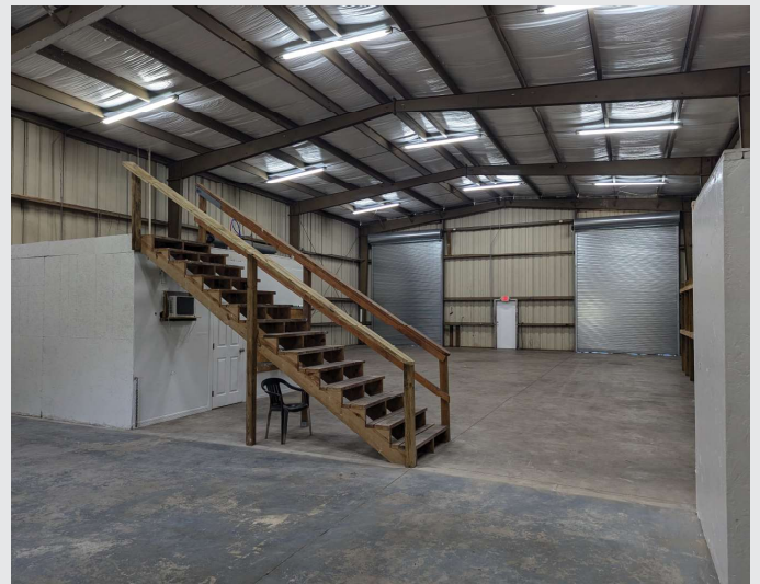
20 Ft Peak Free Span