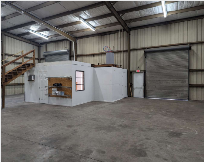
12' Door. AC Office