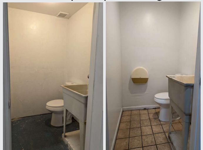
3 Bathrooms Including Shower