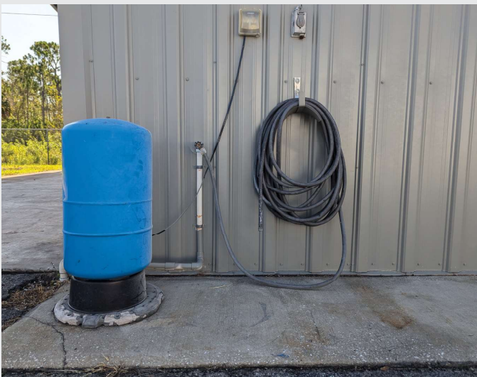
3" Outside Well