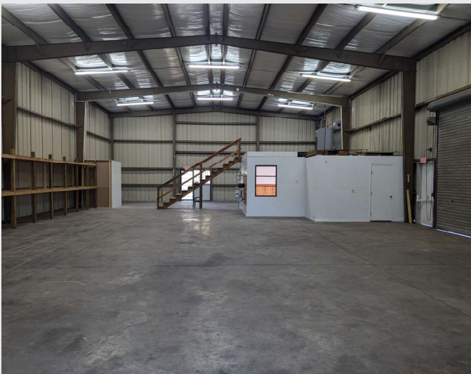
New Insulated SS Metal Roof