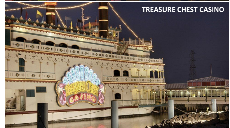
TREASURE CHEST CASINO

THIS INFORMATION HAS BEEN SECURED FROM SOURCES WE BELIEVE TO BE RELIABLE, BUT WE MAKE NO REPRESENTATIONS OR WARRANTIES, EXPRESSED OR IMPLIED, AS TO THE ACCURACY OF THE INFORMATION. REFERENCES TO SQUARE FOOTAGE OR AGE ARE APPROXIMATE. UPLAND HAS NOT REVIEWED OR VERIFIED THIS INFORMATION. BUYER MUST VERIFY THE INFORMATION AND BEARS ALL RISK FOR ANY INACCURACIES.