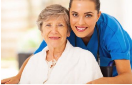
St. Joseph Hospice