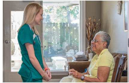
The Carpenter House