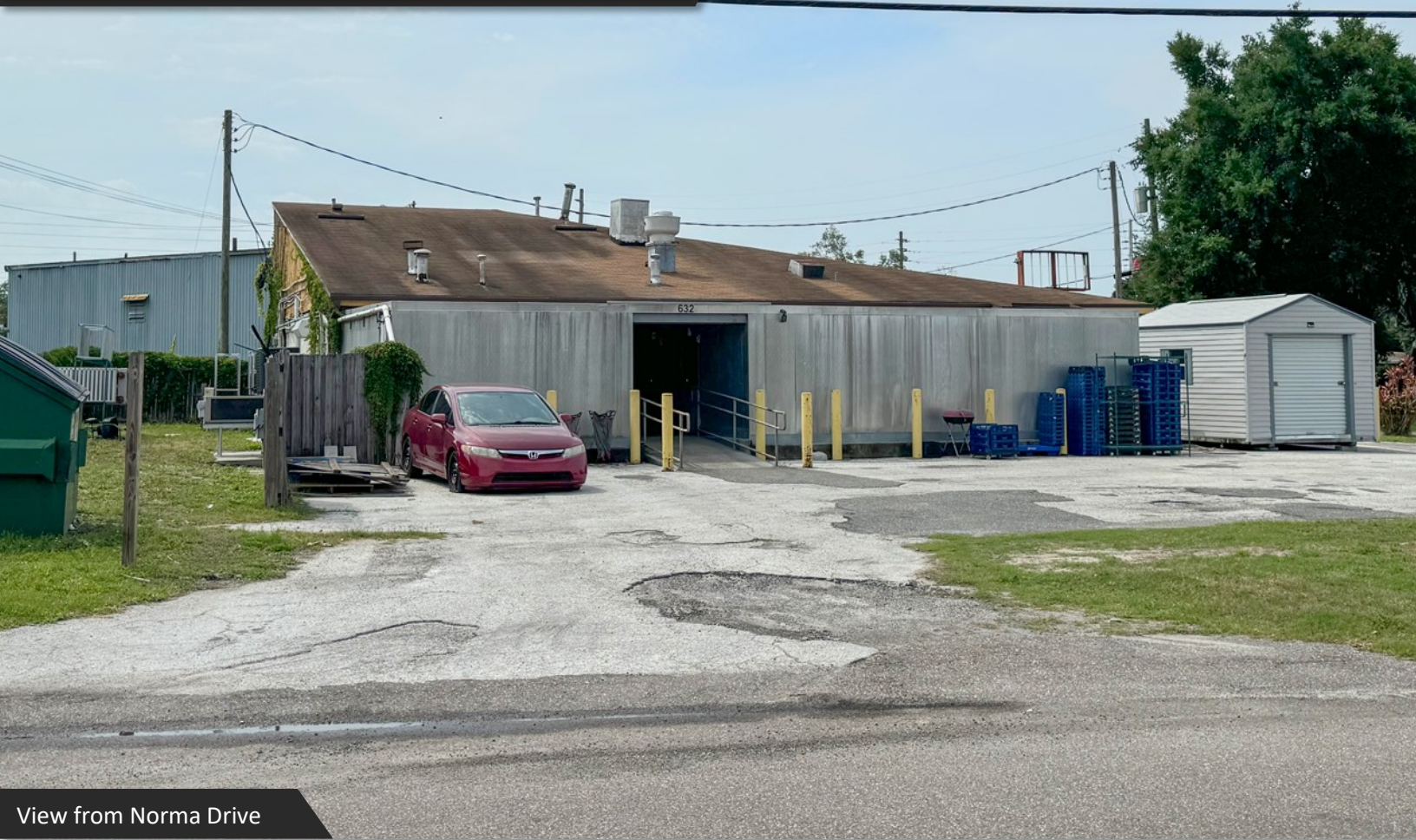
View from Norma Drive