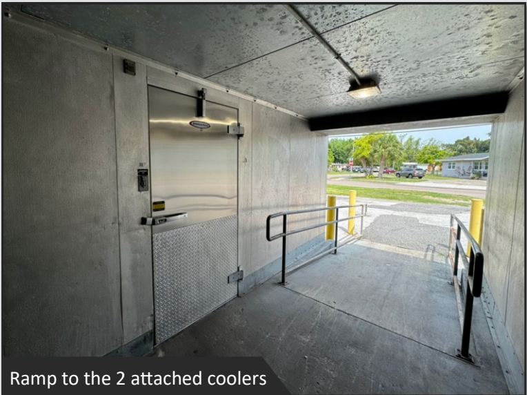
Ramp to the 2 attached coolers