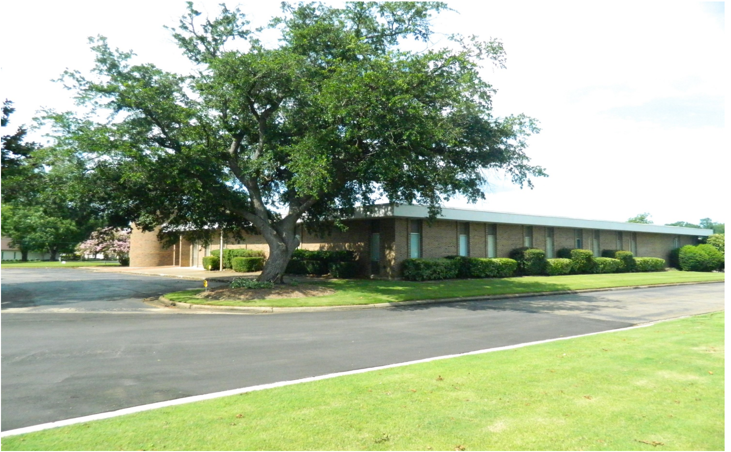
BUILDING I- BACK