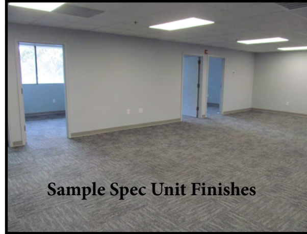
Sample Spec Unit Finishes