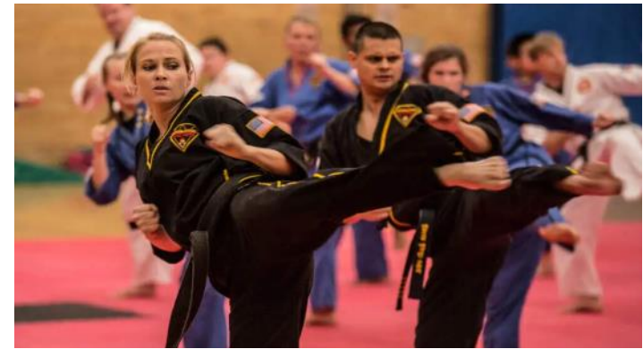
National Karate has nearly 30 locations throughout Minnesota, Colorado, Illinois, Wisconsin, & Florida.

National Karate has been voted "Best Martial Arts School" in the Chicago Suburbs for 6 years in a row and is Minnesota's largest professional karate and self-defense school. It teaches a combination of martial arts that include Tae Kwon Do, Karate, Kickboxing and Krav Maga. National Karate also teaches a variety of self defense and safety seminars. National Karate has been training students since 1973 building self-esteem, focus, leadership skills and more.