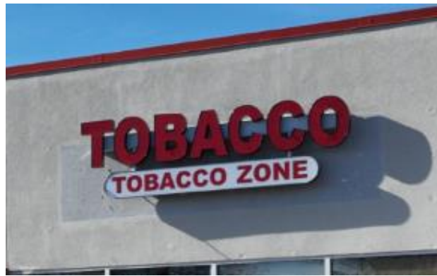
Smokey's Tobacco & Vape specializes in Tobacco sales.

Produce quality mattresses in our own factory and sell them directly to consumers, eliminating the middleman and providing real value. It sells a variety of mattress related products including box springs, adjustable beds, bed frames, headboards, bed and mattress accessories, and more. The Original Mattress Factory is consistently testing new products and researching ways to improve its products.