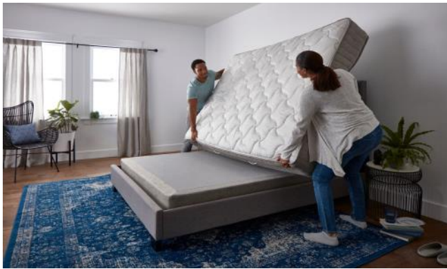
The Original Mattress Factory has 12 factories and over 100 showrooms.

Produce quality mattresses in our own factory and sell them directly to consumers, eliminating the middleman and providing real value. It sells a variety of mattress related products including box springs, adjustable beds, bed frames, headboards, bed and mattress accessories, and more. The Original Mattress Factory is consistently testing new products and researching ways to improve its products.