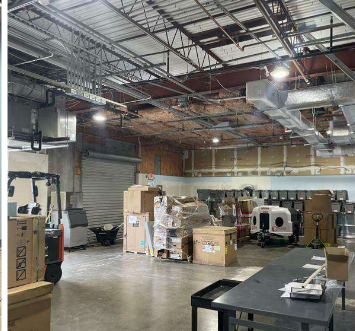
Suite 3600 - Warehouse