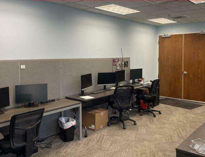
Suite 3600 Office