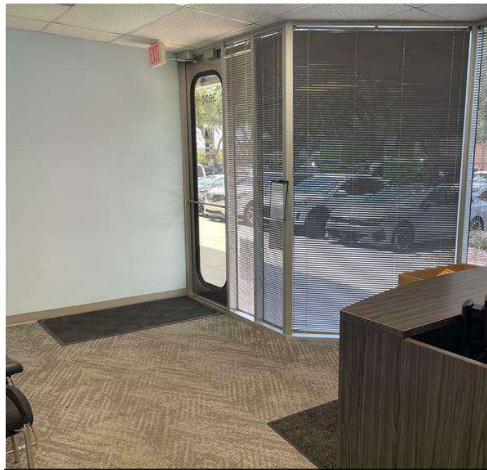
Suite 3500 - Office