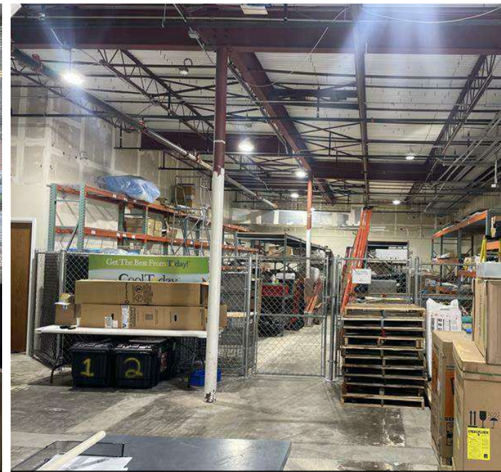
Suite 3500 - Warehouse