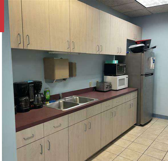
Suite 3600 - Breakroom