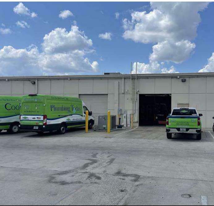
Suite 3600 - Receiving Area