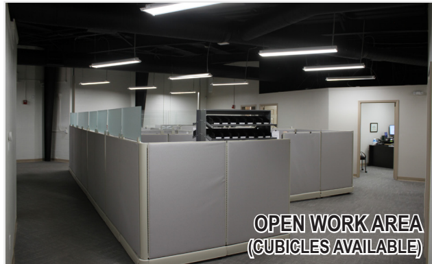
OPEN WORK AREA (CUBICLES AVAILABLE)