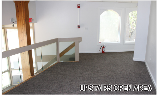
UPSTAIRS OPEN AREA