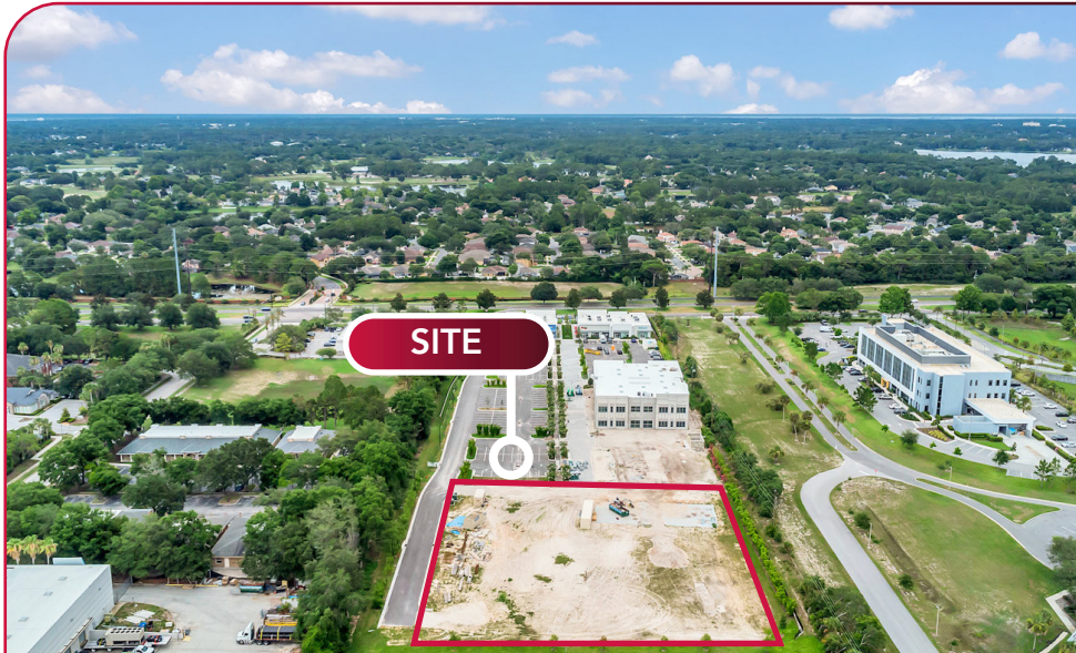
BENTS LANDING | SOUTH FACING