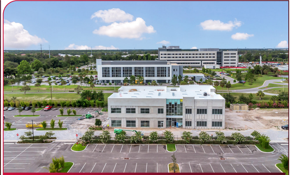
MEDICAL OFFICE BUILDING #1