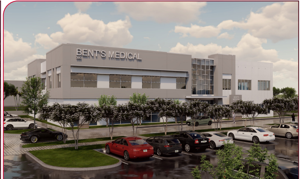
MEDICAL OFFICE BUILDING #2 RENDERING