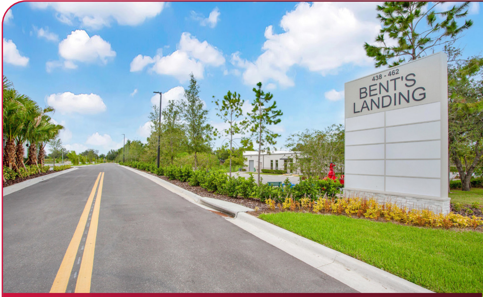
MASTER PYLON SIGNAGE AVAILABLE - PRORATA SHARE