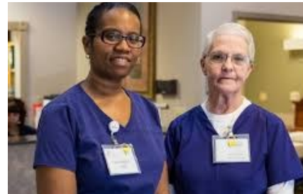
Sage Specialty Hospital (LTAC)

THIS INFORMATION HAS BEEN SECURED FROM SOURCES WE BELIEVE TO BE RELIABLE, BUT WE MAKE NO REPRESENTATIONS OR WARRANTIES, EXPRESSED OR IMPLIED, AS TO THE ACCURACY OF THE INFORMATION. REFERENCES TO SQUARE FOOTAGE OR AGE ARE APPROXIMATE. UPLAND HAS NOT REVIEWED OR VERIFIED THIS INFORMATION. BUYER MUST VERIFY THE INFORMATION AND BEARS ALL RISK FOR ANY INACCURACIES.