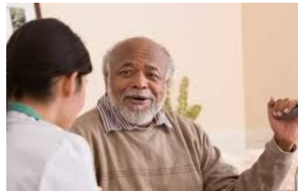
Companion House Services