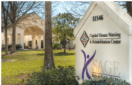
Capitol House Nursing & Rehabilitation

Mission: The Carpenter Health Network will joyfully provide optimal patient care seamlessly across service lines to ensure spiritual, emotional, and physical healing wherever possible while always respecting life, fostering dignity, and preserving quality of life.