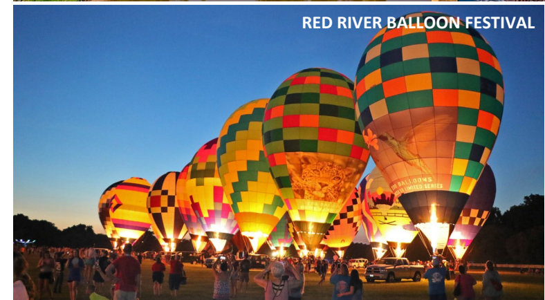
RED RIVER BALLOON FESTIVAL