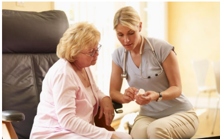
STAT Home Health

Its Network of Care: Your health journey is unique and changing, and The Carpenter Health Network is designed to provide a seamless transition of care each step of the way. We provide compassionate support and convenient care when you need it, where you need it and at any phase of illness or injury.