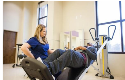
Sage Rehabilitation Hospital & Outpatient Services