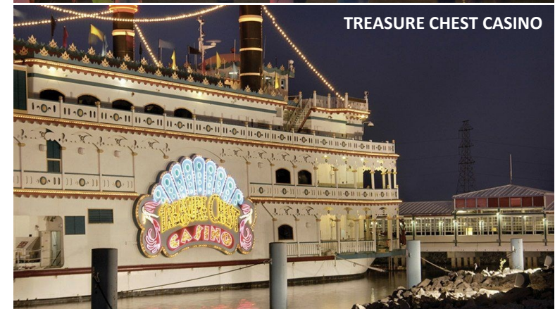
TREASURE CHEST CASINO

THIS INFORMATION HAS BEEN SECURED FROM SOURCES WE BELIEVE TO BE RELIABLE, BUT WE MAKE NO REPRESENTATIONS OR WARRANTIES, EXPRESSED OR IMPLIED, AS TO THE ACCURACY OF THE INFORMATION. REFERENCES TO SQUARE FOOTAGE OR AGE ARE APPROXIMATE. UPLAND HAS NOT REVIEWED OR VERIFIED THIS INFORMATION. BUYER MUST VERIFY THE INFORMATION AND BEARS ALL RISK FOR ANY INACCURACIES.