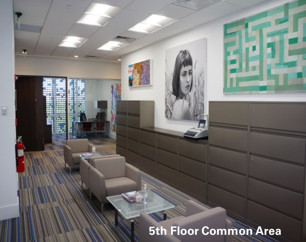
5th Floor Common Area