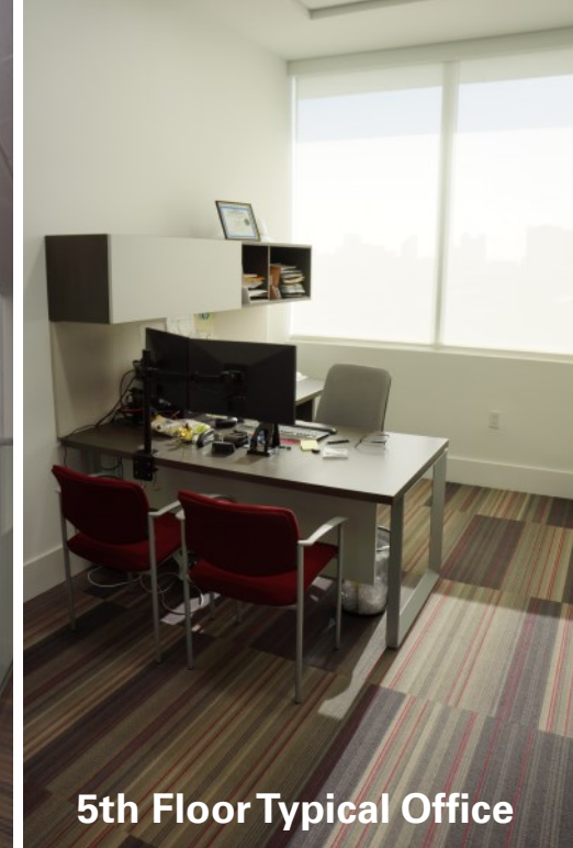
5th Floor Typical Office