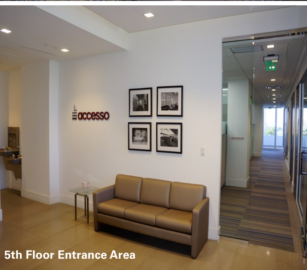
5th Floor Entrance Area