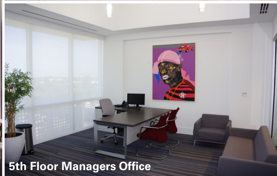
5th Floor Managers Office