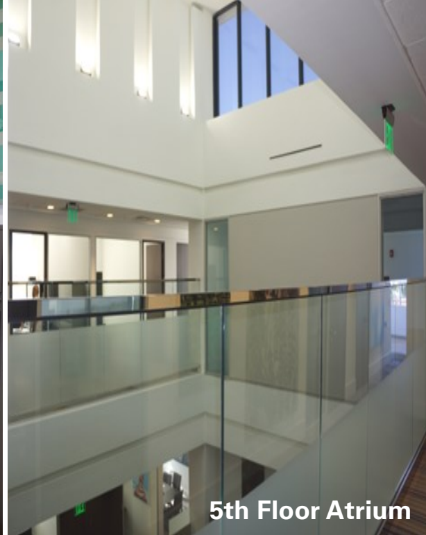
5th Floor Atrium