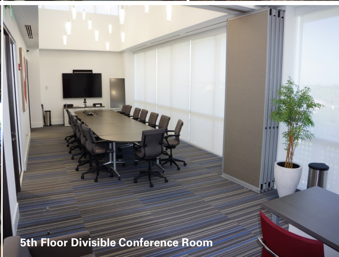
5th Floor Divisible Conference Room