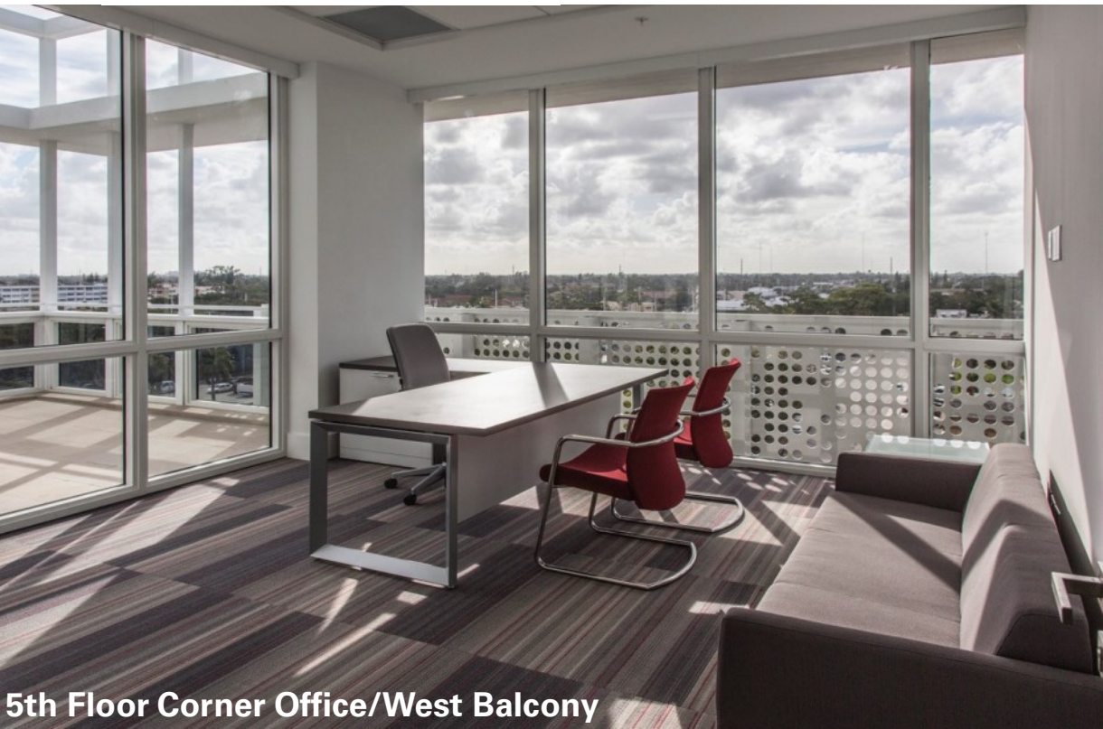
5th Floor Corner Office/West Balcony