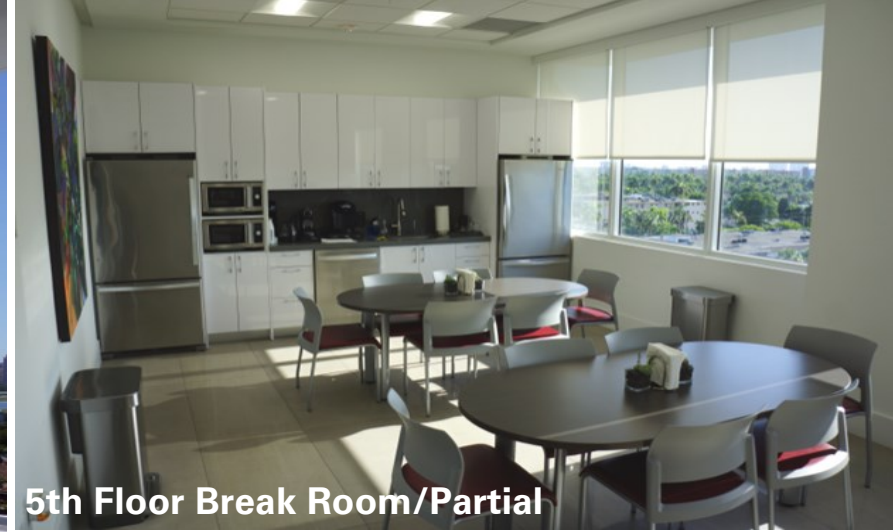
5th Floor Break Room/Partial