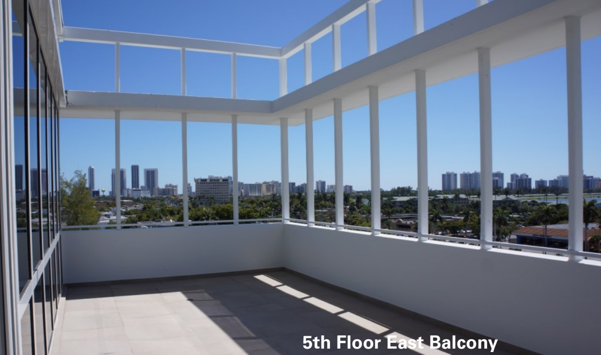
5th Floor East Balcony