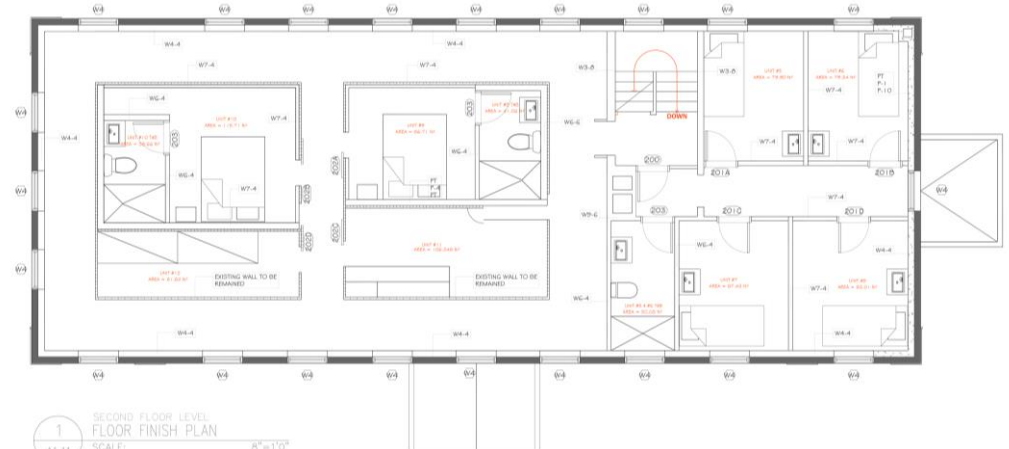
1 SECOND FLOOR LEVEL FLOOR FINISH PLAN SCALE: 8"=10" A1.11