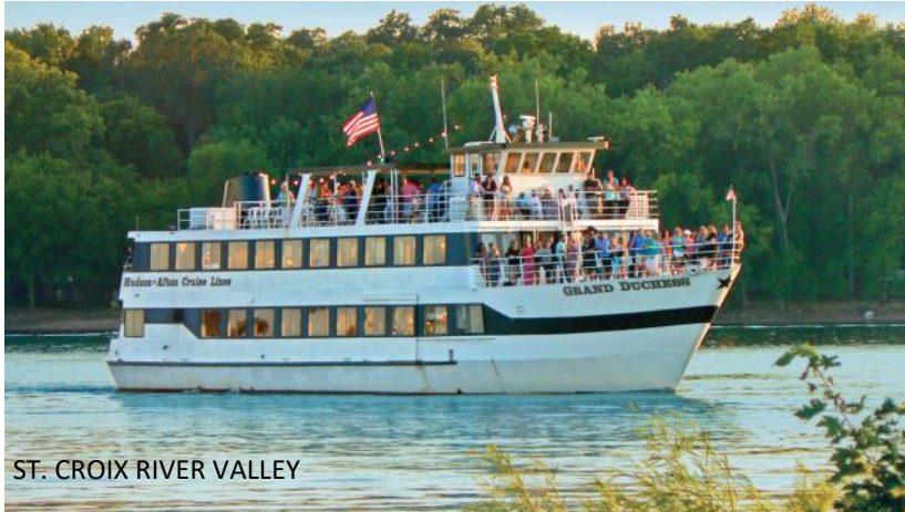
ST. CROIX RIVER VALLEY

This multi-tenant property is located on Coller Way where traffic counts average 15,000 vehicles per day on Tamarack Road while traffic counts average 29,000 vehicles per day on Radio Dr. This shopping area is located off exits to I-94 & I-494. Properties in the nearby area include Whole Foods, The Home Depot, PetSmart, Bed Bath & Beyond, Dick’s Sporting Goods, Sierra, Cabela’s, ALDI, Cub Foods, and many more in this heavy retail area. Located almost adjacent to the property is Tamarack Village, one of the Twin Cities most successful shopping centers, which is over 800,000 square feet with over 60 stores and dining options.