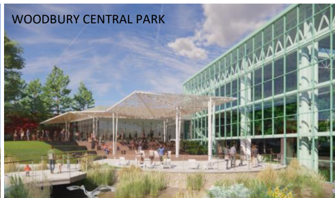
WOODBURY CENTRAL PARK