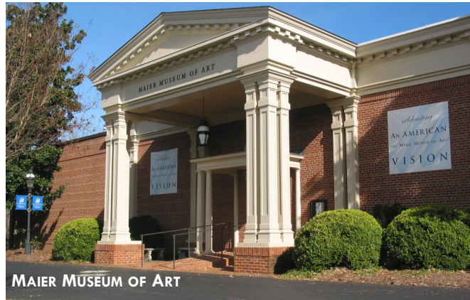
MAIER MUSEUM OF ART