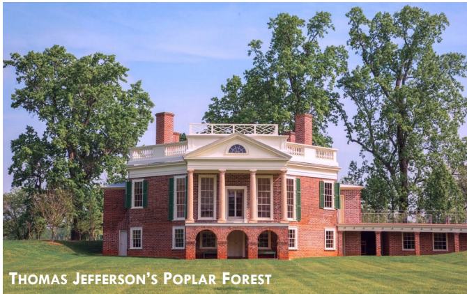
THOMAS JEFFERSON’S POPLAR FOREST

Another popular attraction in Lynchburg is the Maier Museum of Art located at Randolph College. This museum is one of the best American Art collections in the country through the 19th-21st centuries. One of the most popular trails in the city, The Blackwater Creek Trail, is perfect for jogging, walking, biking, and more.