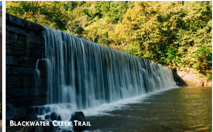
BLACKWATER CREEK TRAIL

THIS INFORMATION HAS BEEN SECURED FROM SOURCES WE BELIEVE TO BE RELIABLE, BUT WE MAKE NO REPRESENTATIONS OR WARRANTIES, EXPRESSED OR IMPLIED, AS TO THE ACCURACY OF THE INFORMATION. REFERENCES TO SQUARE FOOTAGE OR AGE ARE APPROXIMATE. UPLAND HAS NOT REVIEWED OR VERIFIED THIS INFORMATION. BUYER MUST VERIFY THE INFORMATION AND BEARS ALL RISK FOR ANY INACCURACIES.