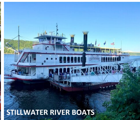
STILLWATER RIVER BOATS