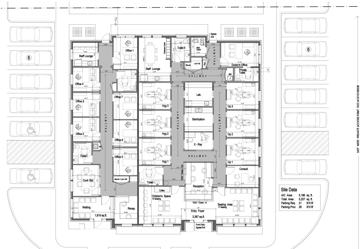
Conceptual Floor Plan