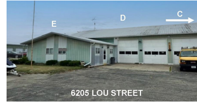
6205 LOU STREET