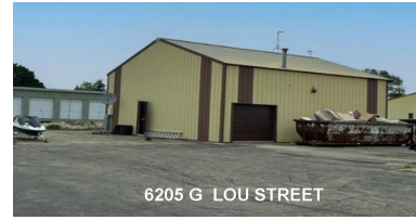
6205 G LOU STREET