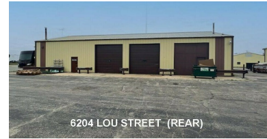
6204 LOU STREET (REAR)